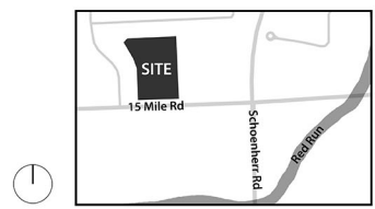
SITE LOCATION MAP NOT TO SCALE

DISCLAIMER THIS DRAWING IS ILLUSTRATIVE AND FOR INFORMATION PURPOSES ONLY AND SHOULD NOT BE CONSIDERED COMPREHENSIVE. DRAWING LAYOUT, SIZES, QUANTITIES, ETC. ARE SUBJECT TO SITE VERIFICATION BY THE USER OF THIS DOCUMENT. THIS LAYOUT MAY NOT BE FINAL, NOR TO SCALE AND IS SUBJECT TO CHANGE WITHOUT NOTICE. PFMG DEVELOPMENT, LLC / NUDELL ARCHITECTS IS NOT RESPONSIBLE FOR ERRORS OF OMISSIONS AND NO REPRESENTATION OR WARRANTIES ARE EXPRESSED OR IMPLIED BY THIS DRAWING