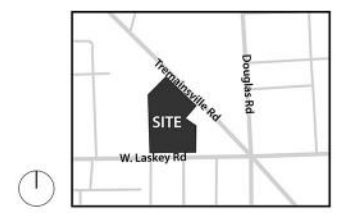
SITE LOCATION MAP NOT TO SCALE

DISCLAIMER THIS DRAWING IS ILLUSTRATIVE AND FOR INFORMATION PURPOSES ONLY AND SHOULD NOT BE CONSIDERED COMPREHENSIVE. DRAWING LAYOUT, SIZES, QUANTITIES, ETC. ARE SUBJECT TO SITE VERIFICATION BY THE USER OF THIS DOCUMENT. THIS LAYOUT MAY NOT BE FINAL, NOR TO SCALE AND IS SUBJECT TO CHANGE WITHOUT NOTICE. PFMG DEVELOPMENT LLC / NUDELL ARCHITECTS IS NOT RESPONSIBLE FOR ERRORS OR OMISSIONS AND NO REPRESENTATION OR WARRANTIES ARE EXPRESSED OR IMPLIED BY THIS DRAWING