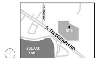
SITE LOCATION MAP NOT TO SCALE